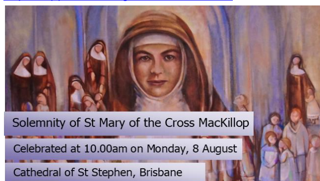
Solemnity of St Mary of the Cross MacKillop

Thursday 4 August, 9am-10.15am at Australian Catholic University, Banyo. To find out more or register: https://app.tickets.org.au/eb/LBSS22_1