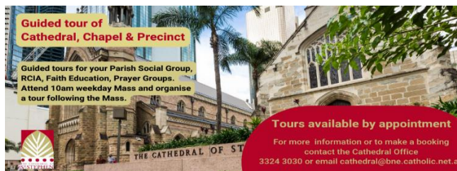
Guided tour of Cathedral, Chapel & Precinct

Respect: Confronting Violence and Abuse from the Australian Catholic Bishops' Conference. A Brisbane launch of the Social Justice Statement will take place at St James' Hall, 92 Kirkland Ave, Coorparoo, on Tuesday 23 August, 7pm for 7.30pm. All are welcome.